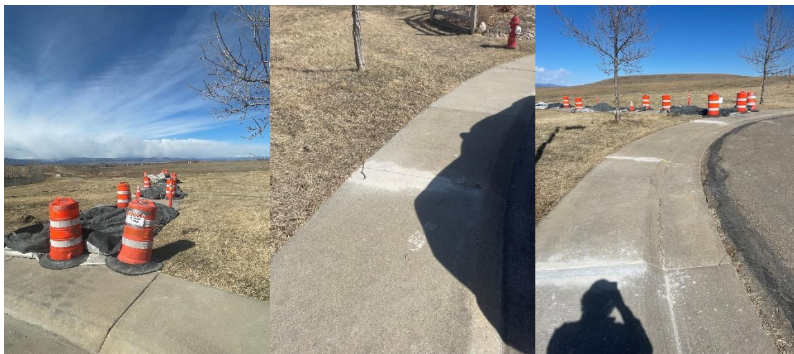
A1-6, A7-8, A9-10 COMPLETE

RCD Construction has completed all of Phase 1 except for the “Change Order” sections of trail on Pinion Place.