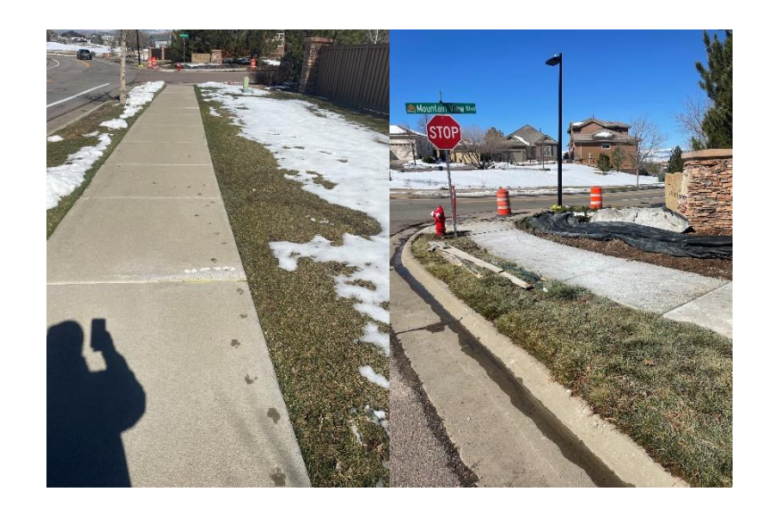
ME23, ME25, ME26, ME27, AND ME28 COMPLETE