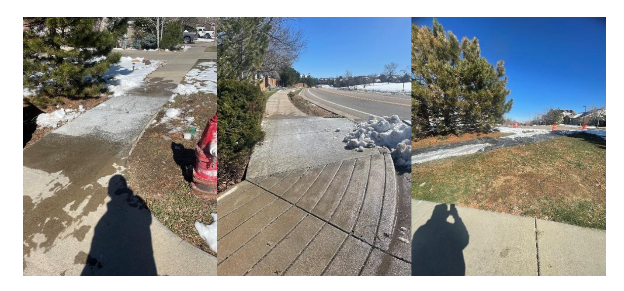
SKN11. SKN12, SKN13, SKN14, SKN15, AND SKN16 COMPLETE