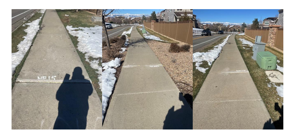
ME15, ME16, AND ME17 COMPLETE