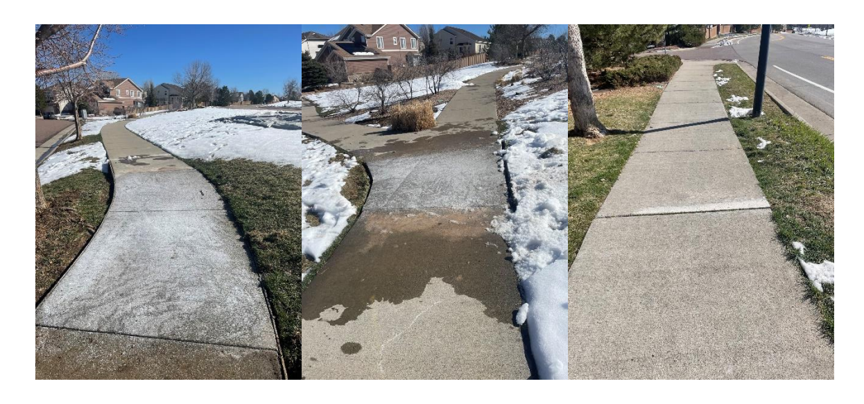
SKN8, SKN9, AND SKN10 COMPLETE