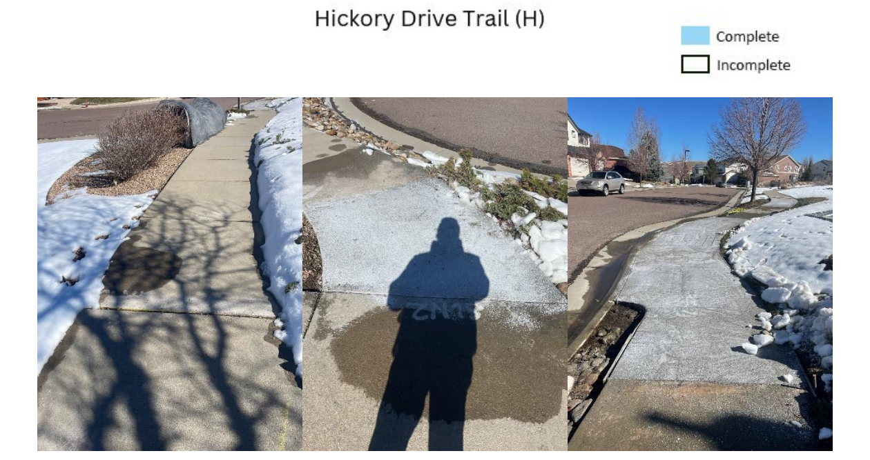
SKN1, SKN2, SKN3, SKN4, SKN5, SKN6, AND SKN7 COMPLETE