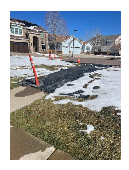
ME18 AND ME19 INCOMPLETE