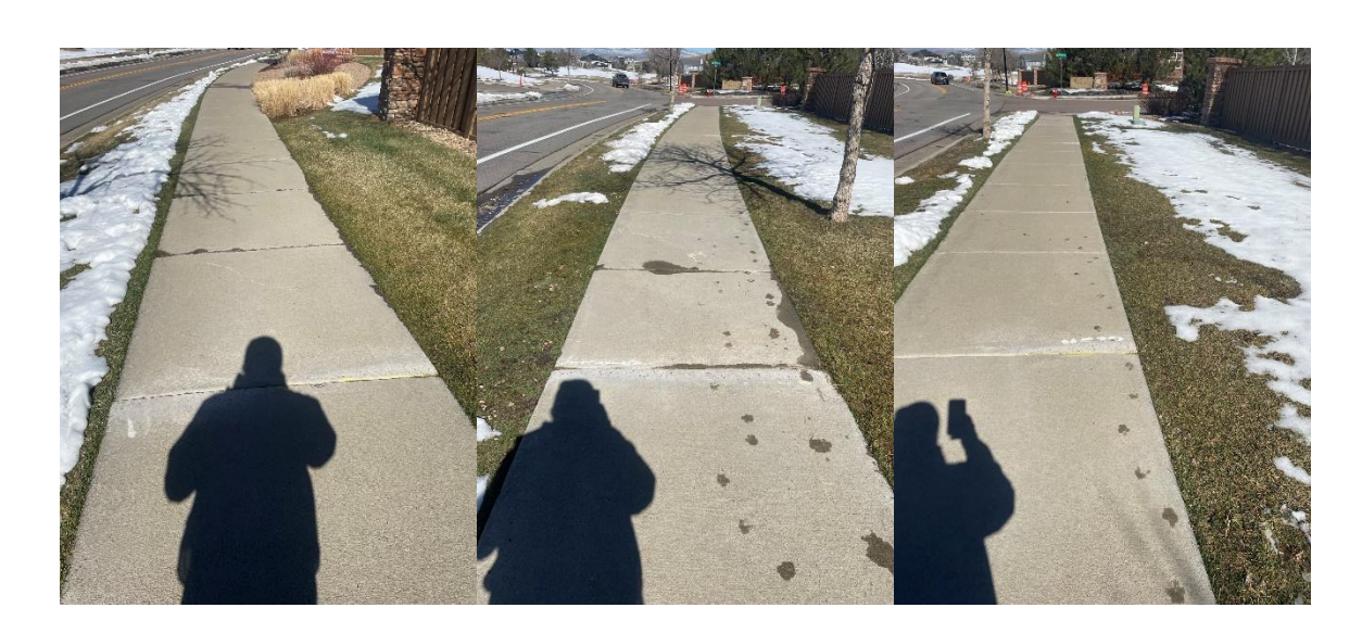
ME21, ME22, AND ME23 COMPLETE