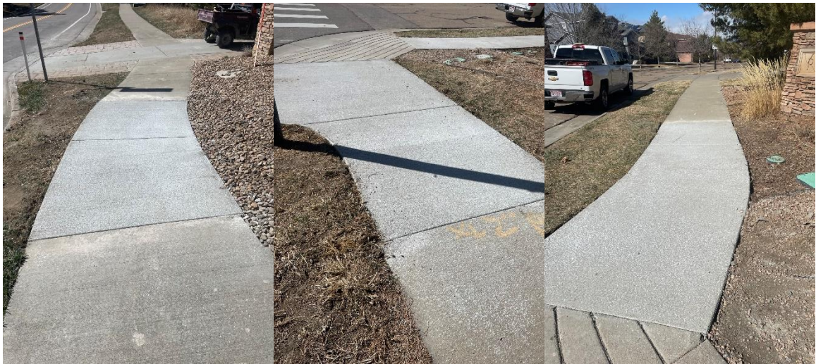
SLN34, SLN33, AND SLN32 COMPLETED