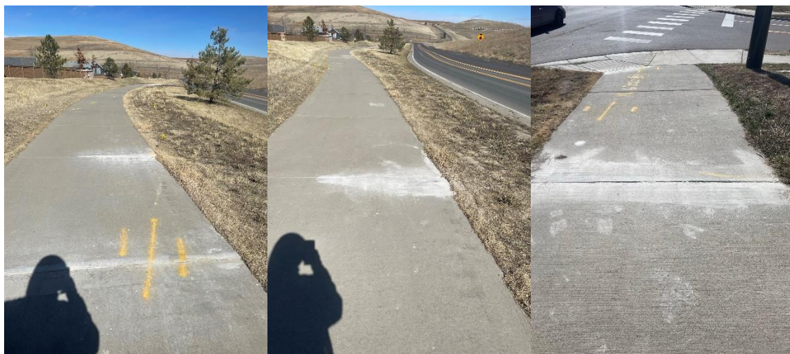
S18 AND S19 COMPLETE