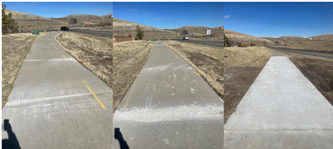
S22, S21, AND S20 COMPLETE

As of 3/4/24 all of Phase 2 is completed.