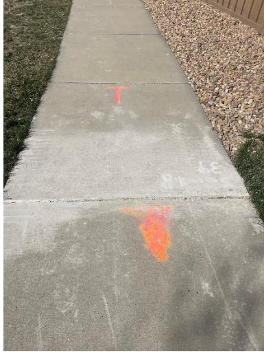
SLN39, SLN40, SLN41, SLN42, AND SLN43 COMPLETED