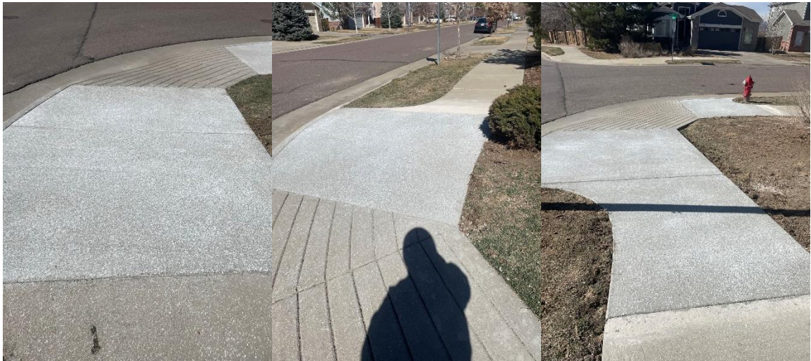
SLN38, SLN37, AND SLN35 COMPLETED